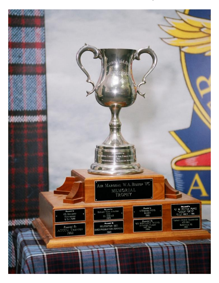
SECTION 2 - THE AIR MARSHAL W.A. BISHOP, VC MEMORIAL TROPHY