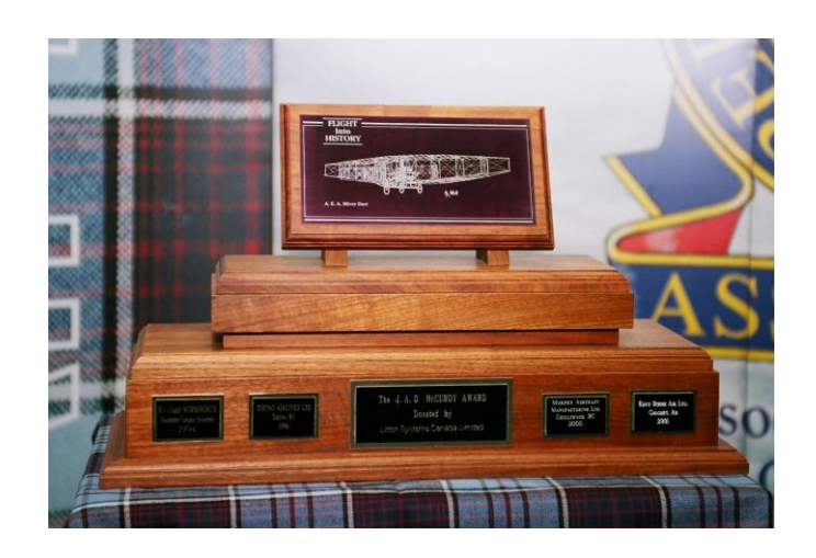
SECTION 5 - THE JAD McCurdy Trophy