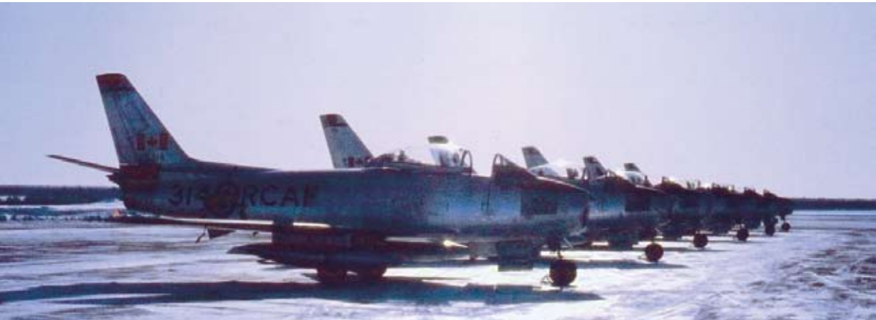
Two historical photos of 23314 taken by RCAF Sabre pilot Bill Turnbull, one airborne near RCAF Station Chatham and the other on the STU flightline, January 1966. (Bill Turnbull)

4. Included among the dozens of RCAF pilots who flew Sabre 23314 are the following: