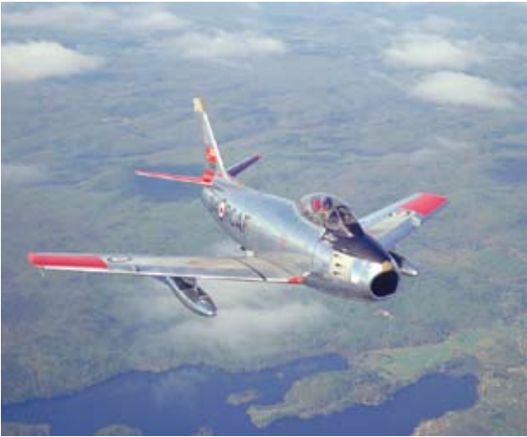
Left: Canadair Sabre 5 - 23314.