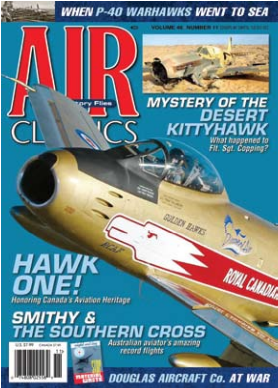
The Hawk One team enjoyed excellent media exposure throughout 2012. At 4 Wing Cold Lake, the Air Cadets named their radio station “CLTC The Hawk” in tribute to Hawk One.