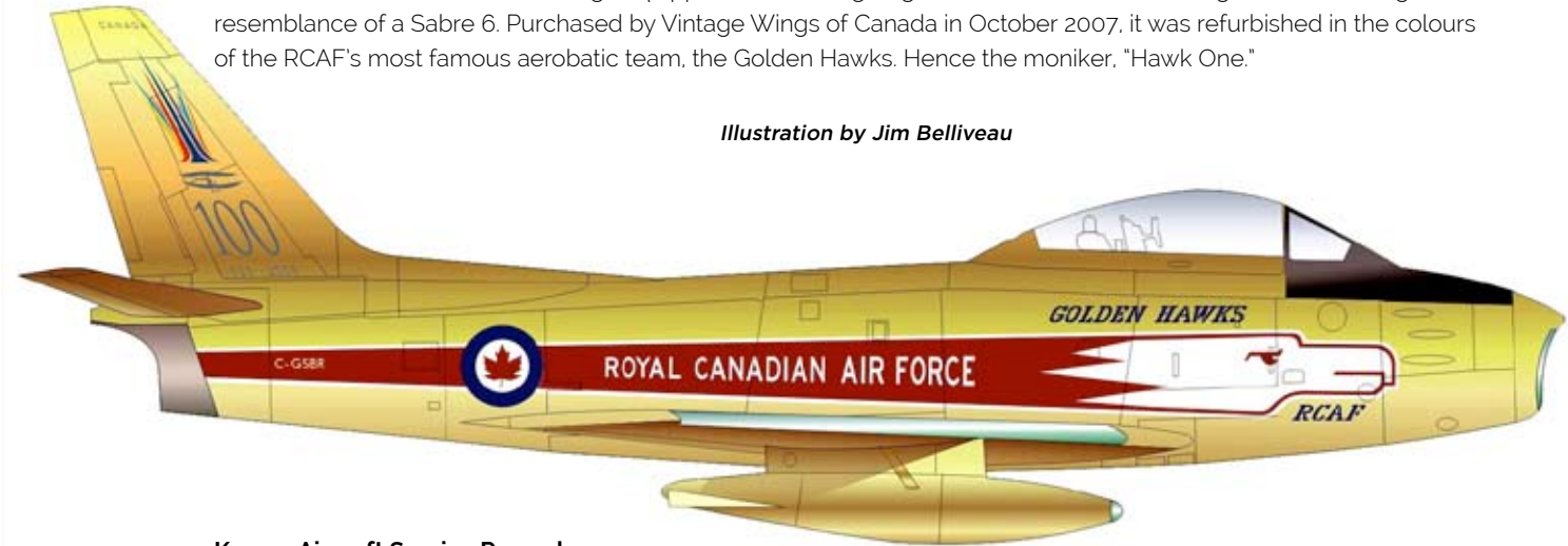
Illustration by Jim Belliveau

The F-86 Sabre that formed the backbone of the Centennial Heritage Flight is a Canadair Sabre 5 that originally bore the RCAF serial number 23314. Manufactured in 1954, it was the 1,104th Sabre to come off the Canadair assembly line. It has been retrofitted with wings equipped with leading edge slats and an Orenda 14 engine, thus bearing all the resemblance of a Sabre 6. Purchased by Vintage Wings of Canada in October 2007, it was refurbished in the colours of the RCAF's most famous aerobatic team, the Golden Hawks. Hence the moniker, "Hawk One."