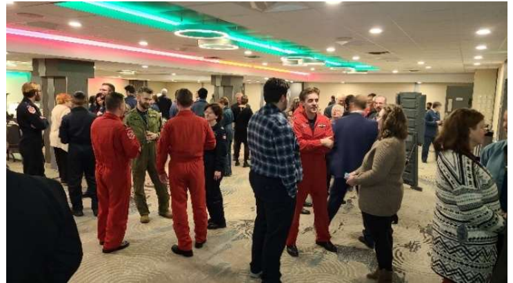
Snowbird pilots and technicians mingle with dinner guests