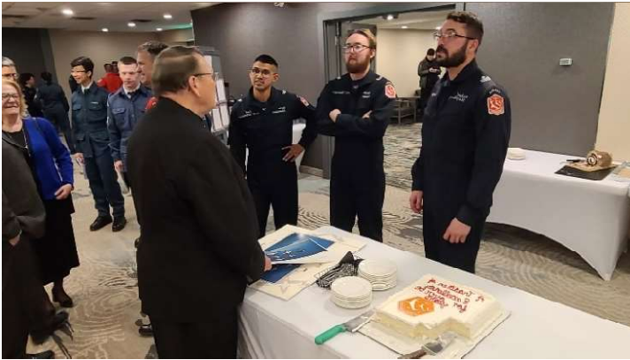
Snowbirds technicians meet with attendees before cutting of the Snowbirds' Over 50th Anniversary cake